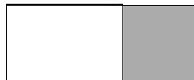
Figure 2. The square area and the side provided with a wasītum .

A similar trick but a different word is used in TMS IX #1, [21] in which the length is added to a rectangular area, and it is explained that this corresponds to the joining of a “base 1” (KI.GUB.GUB 1) to the width – see Figure 3. A third trick, used in the text YBC 4714 #30–39, consists in introducing a “second” width of 25 in order give concrete meaning to the statement that the difference between the squares on the two sides of a rectangle is equal to 25 times the smaller of these sides.